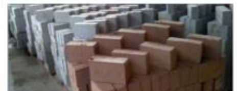
Fly Ash & Red Mud Bricks