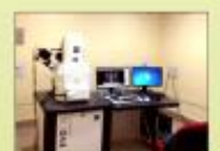
Scanning Electron Microscope