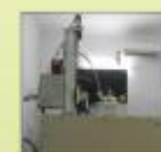
Microwave Plasma Reactor