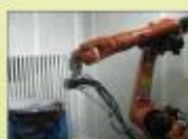
Plasma Spray Coating