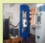
Hydrogen Plasma Reactor