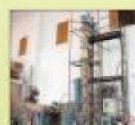
Column Flotation Unit