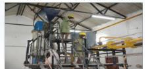
High Concentration Slurry Transportation