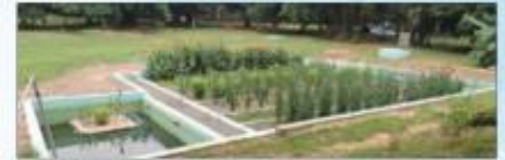
Constructed wetland for waste water treatment