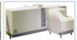
Particle Size Analyzer