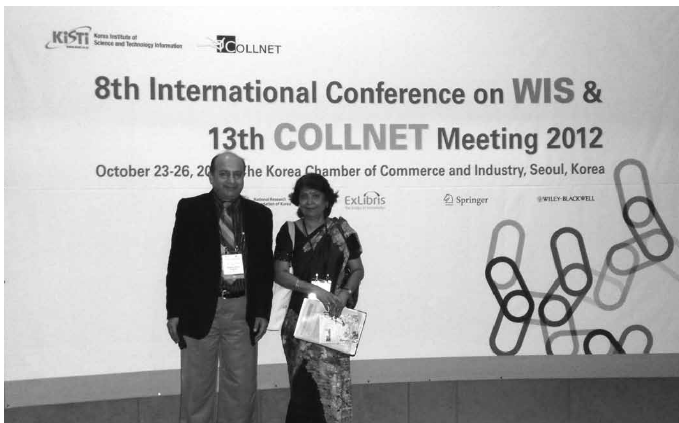
" SIS Executives at COLLNET 2012 Seoul, Korea"